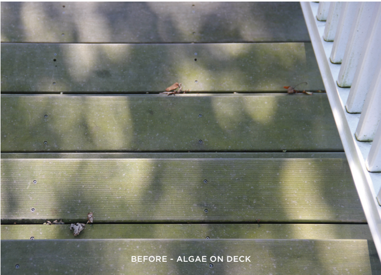
BEFORE - ALGAE ON DECK