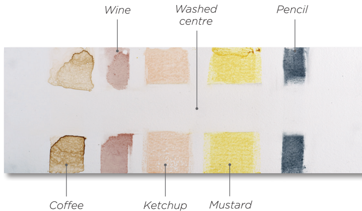
Photograph of AURA® Interior, Eggshell—two coats of Simply White OC-117 over one coat of Fresh Start® High-Hiding All-Purpose Primer.

AURA gives you walls you can wash. These typical household stains have been washed down the centre of drywall painted with AURA Interior, Eggshell.