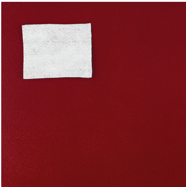
Photograph of AURA® Interior Eggshell—two coats of Caliente AF-290 over one coat of Fresh Start® High-Hiding All-Purpose Primer.

AURA resists colour rub-off, even in deep reds. A white cloth rubbed over AURA remains white.