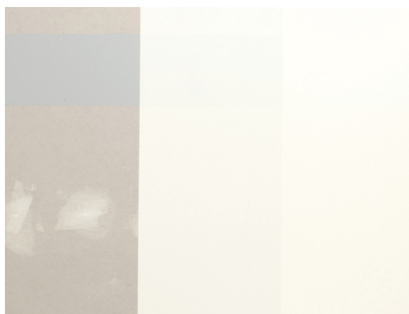
Bare drywall painted with one and two coats of Aura® Interior, Eggshell, Simply White OC-117