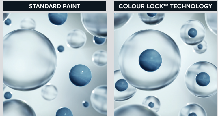
Pigment particles hold loosely to binder molecules

Common colorants require certain chemicals that weaken paint. Our Gennex colorants are designed specifically to enhance our paints, resulting in superior hide and a more durable finish.