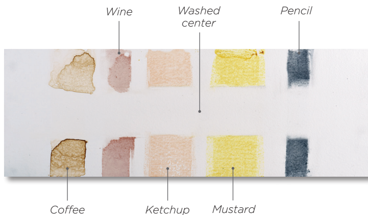
Photograph of AURA® Interior, Eggshell—two coats of Simply White OC-117 over one coat of Fresh Start® High-Hiding All-Purpose Primer.

AURA gives you walls you can wash. These typical household stains have been washed down the center of drywall painted with AURA Interior, Eggshell.