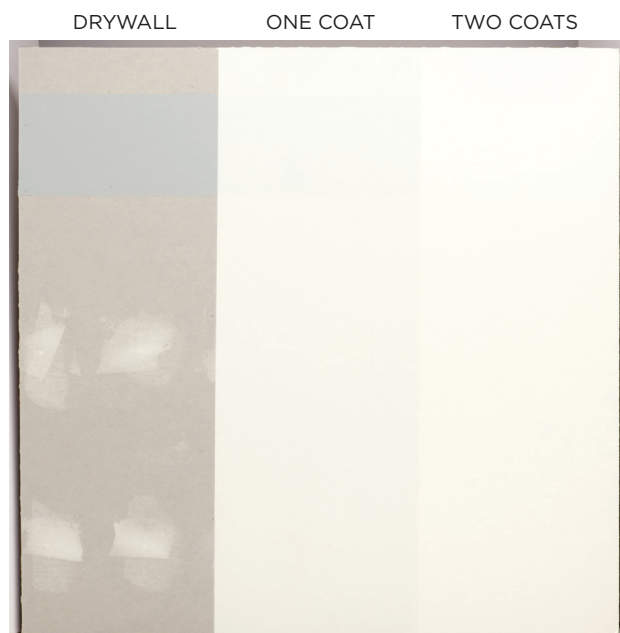
Photograph of bare sheetrock painted with one and two coats AURA® Interior, Eggshell, Simply White OC-117.