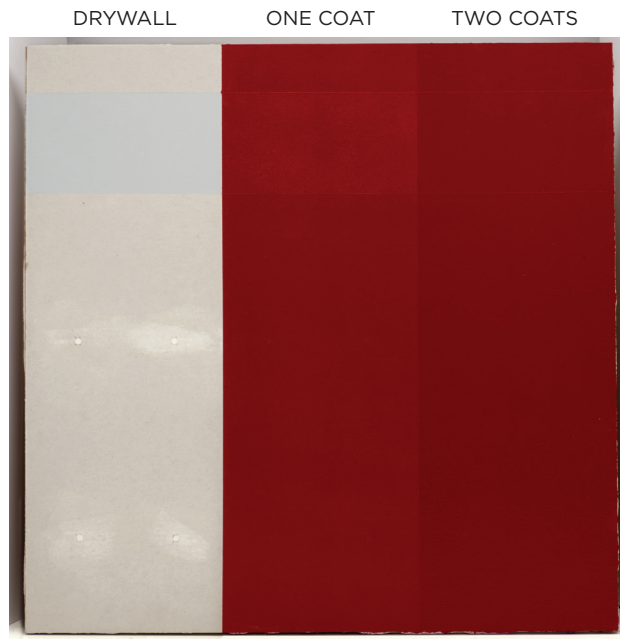
Photograph of bare sheetrock painted with one and two coats of AURA® Interior, Eggshell, Caliente AF-290.

AURA delivers excellent hide and holds its sheen in one and two coats, even on bare sheetrock in most cases.