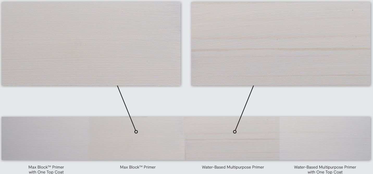
Max Block™ Primer with One Top Coat