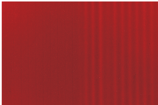
Regal® Select enhanced levelling

Regal Select has always delivered exceptional levelling and hide. But a closer look reveals just how much our enhanced formula improved on its smoothness and colour quality vs. a leading competitor. Below are magnified views of the cured films for Regal® Select (left) and a leading competitor (right). The white ridges on the competitor's side highlight an inferior levelling and hide when compared to Regal Select.