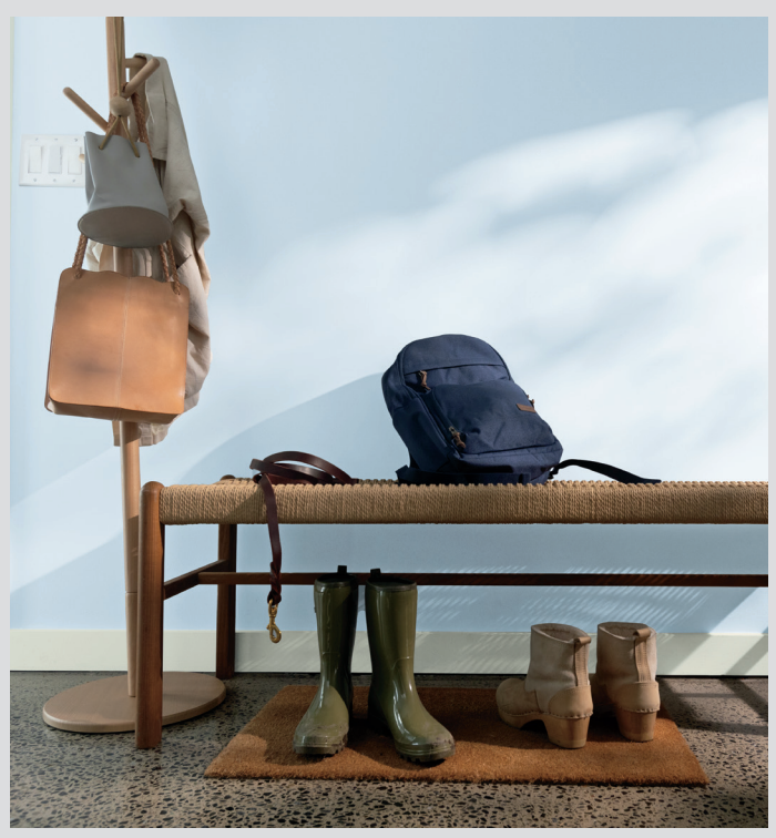
ABOVE: WALL: Beacon Gray 2128-60 TRIM: Gray Owl OC-52

Regal Select Interior's finish is simply beautiful.