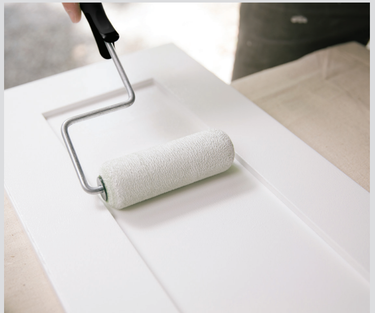
Consult with your local retailer if your cabinets were previously stained as a stain-blocking primer may be required.

After your primer has dried completely, use a 220-grit or finer sandpaper and sand all surfaces lightly. Focus closely on areas that may have drips or pools, such as inside corners and anywhere two flat areas meet.