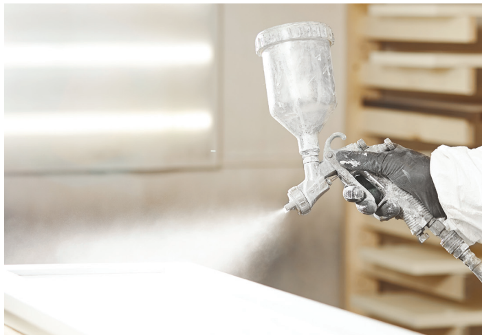
Use an HVLP spray gun with a fine-finish tip for spray applications.

When spraying Advance, make sure you are in a well-ventilated area. We generally recommend using an HVLP spray gun with a fine-finish tip for the smoothest finish, although airless systems can also be used. For more information on spray specifications, please refer to the technical data sheet found on the Benjamin Moore website. Advance can be thinned with water up to 6% by volume if needed. Spray a thin, even coat on all surfaces, paying special attention to edges and corners. Keep a steady pace and maintain a wet edge as you complete each section.