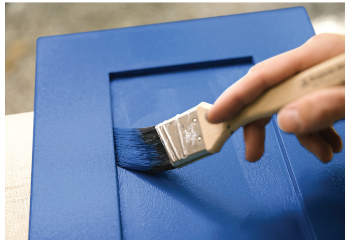
Using a nylon/polyester paintbrush, work from top to bottom, then in full strokes with the grain.

Use a premium Benjamin Moore nylon/polyester brush to apply Advance. Natural-bristle brushes absorb water and hinder even coverage. Work from top to bottom of each piece, first painting across the grain of wood surfaces, then tipping off in full, even strokes with the grain. Paint cabinet doors and other two-sided pieces in a horizontal position so Advance can level out completely. Make sure the paint is dry to the touch before turning pieces and painting the other side.