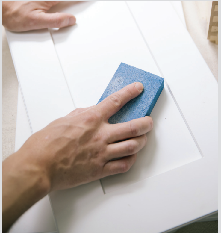
Sand all surfaces and vacuum to remove all dust.

*Follow safety instructions on product label and wear personal protective equipment.